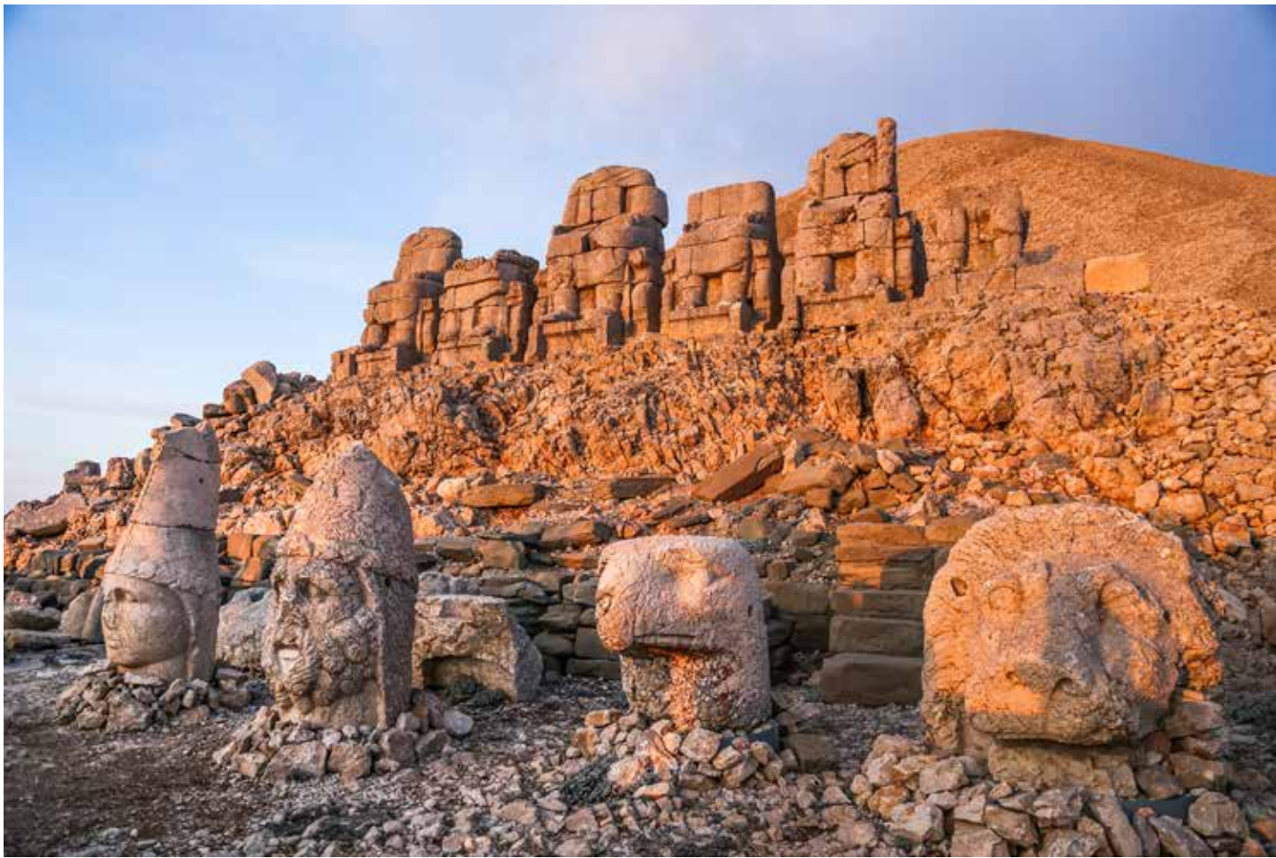
Image: Mount Nemrut

of the mother, sister and niece of Antiochus' son and successor. After lunch we continue to the remote hilltop site of Mount Nemrut (UNESCO World Heritage Site), where Antiochus I had a monumental sanctuary constructed to promote his rule, comprising the world's largest tumulus and a collection of huge statues of the gods and of himself.