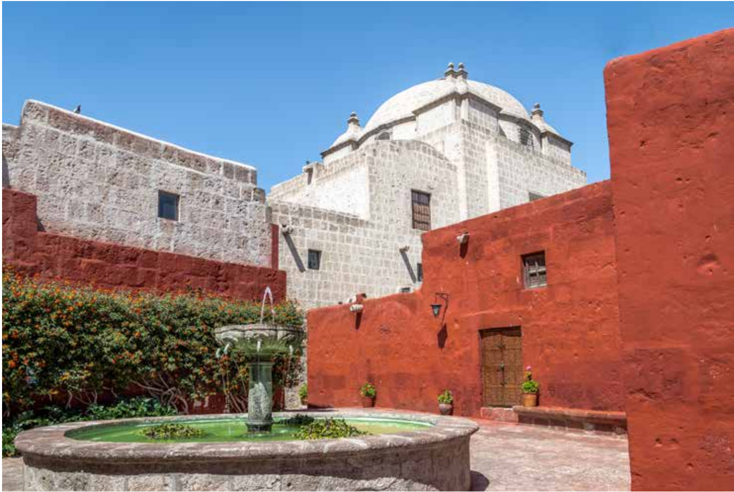
Image: Santa Catalina Monastery

We make our way to Tipon to see this beautifully positioned archaeological site, which has Inca terrace systems. After lunch, we see the Temple of Viracocha at Raqchi, built largely from mudbrick on stone foundations. This is Inca in date, but is surrounded by other structures, notably a large series of storehouses that have recently been discovered to be much earlier.