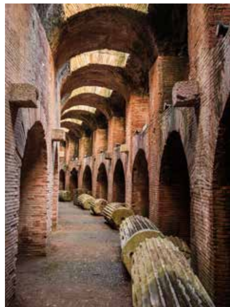
Images top to bottom: Naples with Vesuvius & Flavian Amphitheatre of Pozzuoli

Capua where we see finds that retrace the history of the city. We continue with the well-preserved amphitheatre, the site of the first school of gladiators and the starting point of the third slave rebellion, led by the gladiator Spartacus. In the afternoon we will visit the Museo Campano with its amazing display of goddesses and the Church of Sant'Angelo in Formis which stands on the remains of a temple dedicated to Diana before returning to Naples.