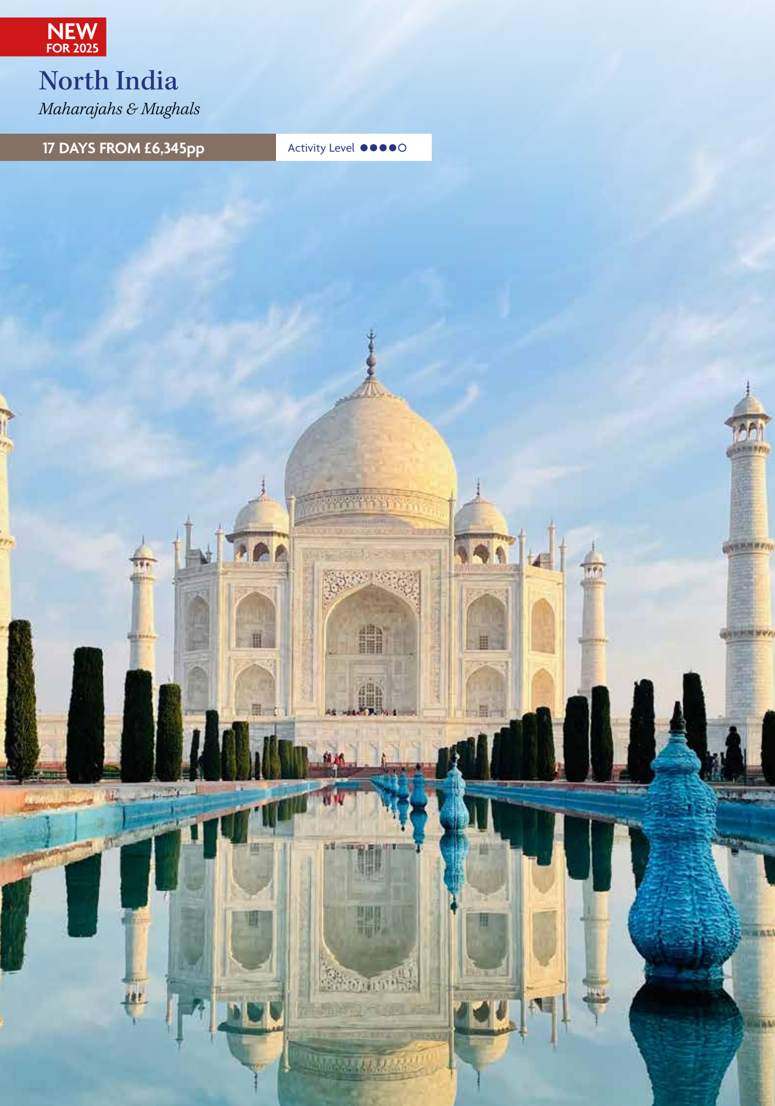
Image: Taj Mahal