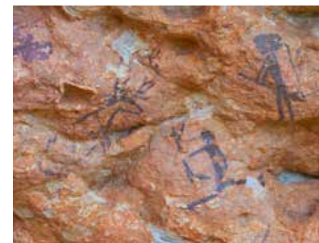
Images top to bottom: Sant Miquel Church in Olerdola & Abrics de l'Ermita Rock Art

This morning we drive to the coastal trading colony and tripartite site of Empuries , which was colonised by Iberian, Greek and Roman settlers. Remains at the site include the ruins of the Greek market and port, an ancient necropolis and the Roman-era walls, mosaics, amphitheatre and early Christian basilica. In the afternoon, we visit the Iron Age settlement of Ullastret , a fascinating early town, developed by the local Iberian tribe of the Indiketes and influenced by the Greek settlers on the coast.