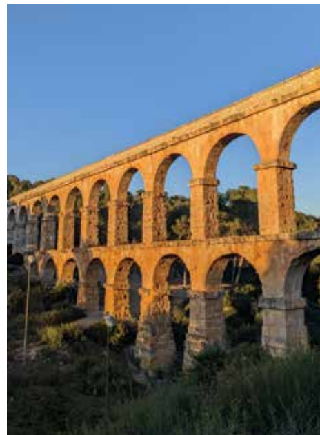
Images top to bottom: Roman amphitheatre of Tarragona & Ferreres Aqueduct

ensemble here is one of the earliest and most comprehensive examples of Roman city planning in the Mediterranean region. We will follow part of the circuit of the town walls and visit the provincial and colonial forums, the amphitheatre and the impressive circus. Our final visit is to the fabulous 12th-century Cathedral built on the site where the Temple of Augustus used to stand.